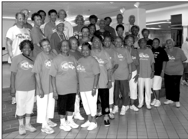
Since 1981, the Iverson Mall Walkers stay fit by staying active—exercising Monday, Wednesday, and Friday mornings at the Mall in Hillcrest Heights. Actively participating walkers include 600 members from around the area. Their Line Dancers group will perform at 8:30 a.m.

Most walkers start walking at 9:00 – Start earlier or later if you like!